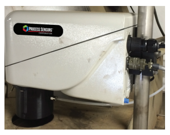
Air Purge To minimize dust buildup on the final window, all the MCT460 Series are fitted with an air purge attachment.